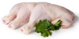
Chicken Leg Quarter HMC