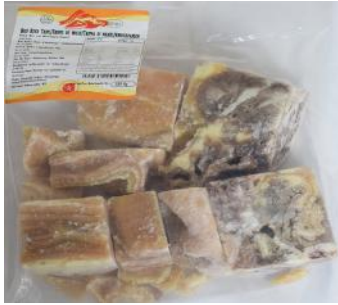
Beef Reed Tripe 15 Pack X 1 Kg