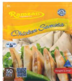
Ramzan Chicken Samosa 50pcs 06 Pack X 50 pcs