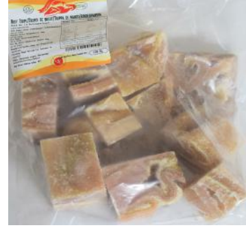
Beef Tripe/ Shaki 15 Pack X 1 kg