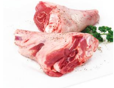
Lamb F/Q Shank