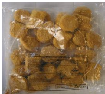
Chicken Nuggets 07 Pack X 800 gm