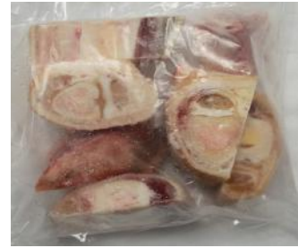
Beef Feet Cut 15 Pack X 1 Kg