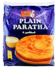
Monsalwa Wheat Paratha Family Pack 20 Pcs X 6 Pkt