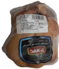
Poussin 500 - 600 Gm IQF X 10 Pcs