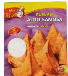
Monsalwa Aloo Samosa 90 Gm 12 Pcs X 10 Pkt