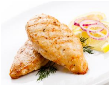
Thai Chicken Fillet