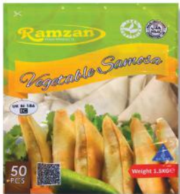
Ramzan Vegetable Samosa 50pcs 06 Pack X 50 pcs