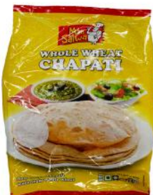
Monsalwa Wheat Chapati 18 Pcs X 8 Pkt