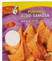
Monsalwa Aloo Samosa 50 Gm 12 Pcs X 10 Pkt