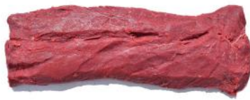
Beef Striploin Pad