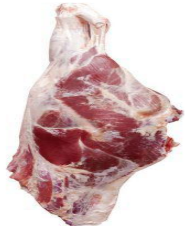
Beef Leg Hind Quarter