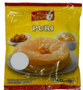
Monsalwa Puri 4 Pcs X 18 Pkt