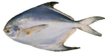
WHITE POMFRET (W)