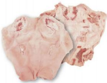
Beef Snoutmask 15 Pack x 1 kg