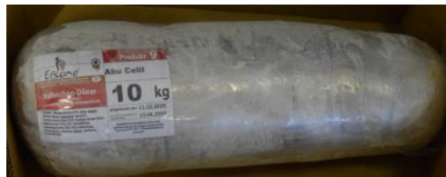
Donner Kebab 10 Kg