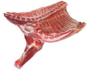
Lamb F/Q Shoulder