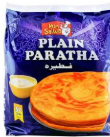
Monsalwa Plain Paratha Family Pack 20 Pcs X 6 Pkt