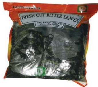
Bitter Leaves 50 Pack X 500gm