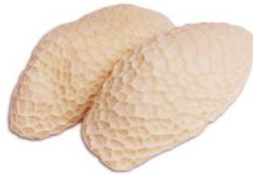
Beef Honeycomb 15 Pack X 1 kg