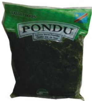
Pongu Skaka 50 Pack X 500gm