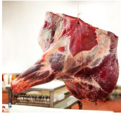
Beef Quarter Shoulder