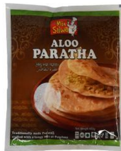
Monsalwa Aloo Paratha 4 Pcs X 18 Pkt