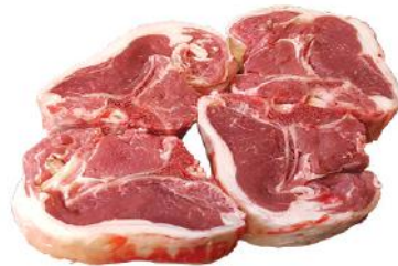
Lamb Neck Chops