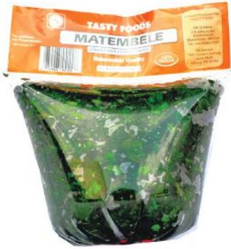
Matembele/Sweet Potato Leaves 20 Pack X 500gm