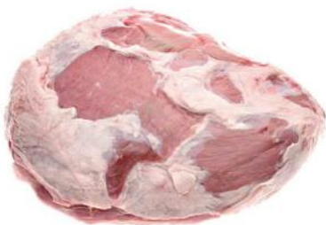
Beef topside cushion