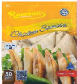
Ramzan Chicken Samosa 20pcs 15 Pack X 20 pcs