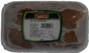
Quails Skinless 100 GM 20 Tray X 4 Birds