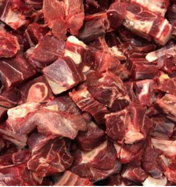
Goat with Bone 15 Pack X 1 kg