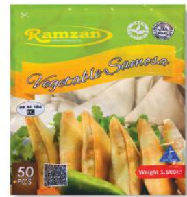
Ramzan Vegetable Samosa 20pcs 15 Pack X 20pcs