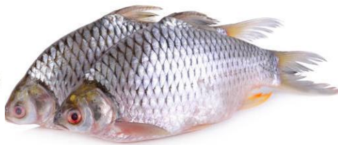
S / PUTI (W)