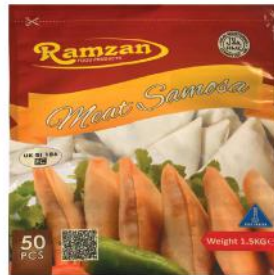
Ramzan Lamb Samosa 20pcs 15 Pack X 20pcs