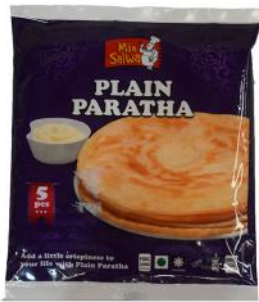
Monsalwa Plain Paratha 5 Pcs X 24 Pkt