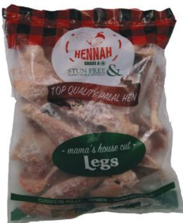
Hen Mama's Leg 5 Pack X 2 Kg

Hen 1000GM X 10 Whole Bird Hen 1000GM X 10 Whole Bird Hen 1000GM X 10 Whole Bird Hen 1000GM X 10 Whole Bird Hen 1000GM X 10 Whole Bird Hen 1000GM X 10 Whole Bird Hen 1000GM X 10 Whole Bird