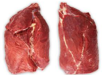
Beef Silverside Pad