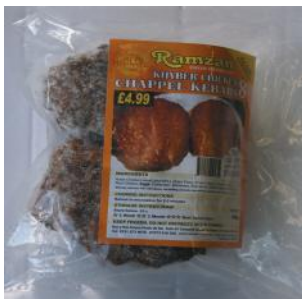
Ramzan Chicken Chappel Kebab 16 Pack X 08 pcs