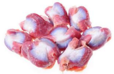
Chicken Gizzard 1 Kg