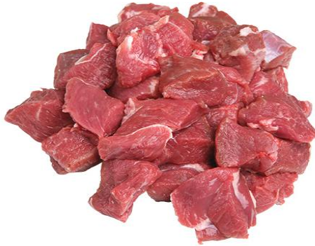
Mutton Diced / Lamb Diced 15 Pack X 1 Kg