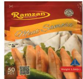
Ramzan Lamb Samosa 50pcs 06 Pack X 50pcs