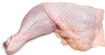
Chicken Leg Quarter 280/300 Gm X 10 kg box 350/380 gm x 10 kg box 300/320 gm X10 Kg Box