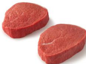
Beef Eye round