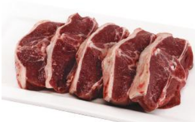
Lamb Back Chops