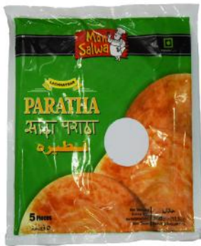
Monsalwa Lacha Paratha 5 Pcs X 24 Pkt