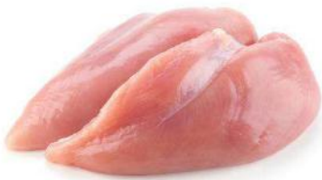
Chicken Fillet 4 Kg X 2 Tray

Chicken 900gm X 10 Bird's Chicken 1000gm X 10 Bird's Chicken 1100gm X 10 Bird's Chicken 1200gm X 10 Bird's Chicken 1300gm X 10 Bird's Chicken 1400gm X 8 Bird's Chicken 1500gm X 8 Bird's Chicken 1600gm X 8 Bird's Chicken 1700gm X 8 Bird's Chicken 1800gm X 8 Bird's