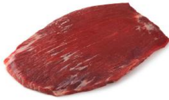
Beef Flank Steak