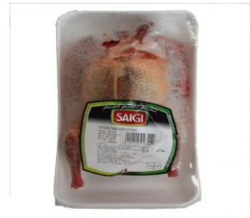
pigeon 350 - 400 Gm X 12 Pcs