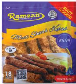
Ramzan Lamb Sheesh Kebab 16 Pack X 18pcs