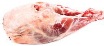
Lamb Double Legs