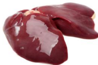
Chicken Liver 1 Kg