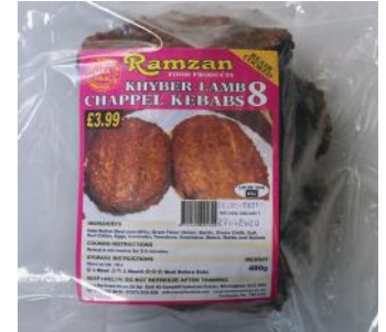
Ramzan Lamb Chappel Kebab 16 Pack X 08 pcs