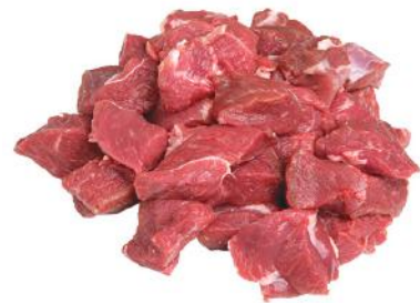
Lamb / Mutton Diced