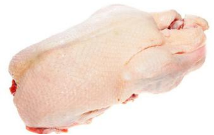
Duck 2100gm IQF X 6 Birds Duck 2200gm IQF X 6 Birds Duck 2300gm IQF X 6 Birds Duck 2400gm IQF X 6 Birds Duck 2600gm IQF X 6 Birds