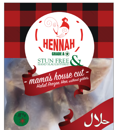
Hen Mama's Cut 15 Pack X 1 Kg