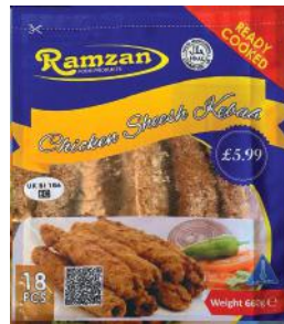
Ramzan Chicken Sheesh Kebab 16 Pack X 18pcs