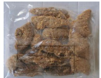
Chicken Gujoun 06 Pack X 800 gm