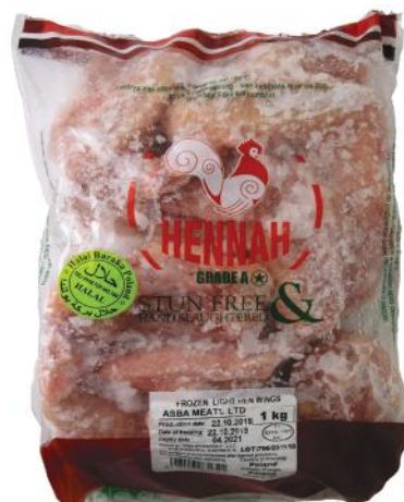
Hen Wings 2 Pack X 2.5 Kg ( 5 Kg Box)