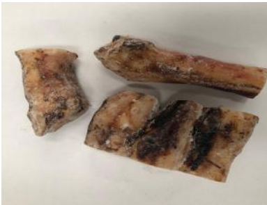
Lamb Feet Cut 15 Pack X 1 Kg