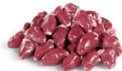
Chicken Heart 1 Kg