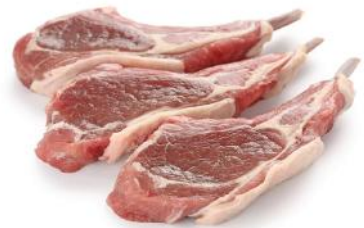
Lamb Front Chops