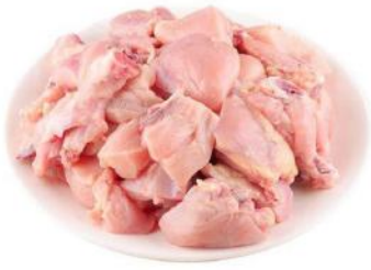
Chicken House Cut HMC