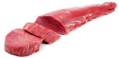
Beef Fillet Steak