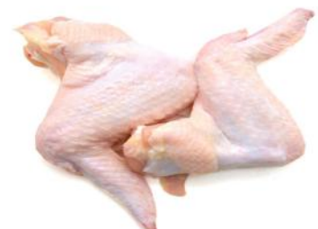
Chicken Wings (3 joint) 10 Kg