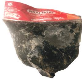
Ngai-Ngai/Sorrel/Busa 20 Pack X 500gm