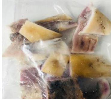
Beef Ponmo 15 Pack X 1 Kg