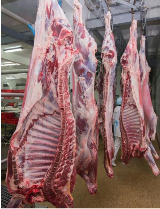
Beef Carcass (Beef whole)