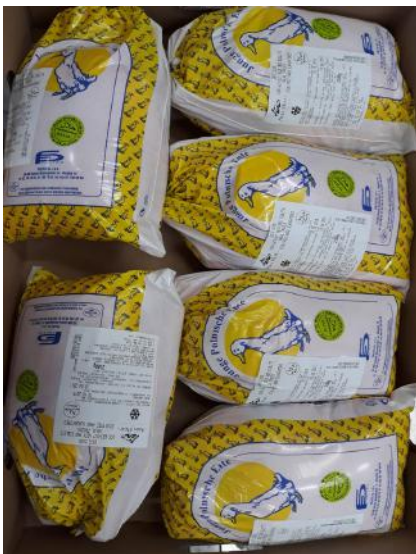
Duck (Whole) W/O Neck & Giblet