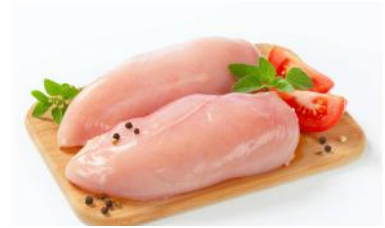
Chicken Fillet HMC