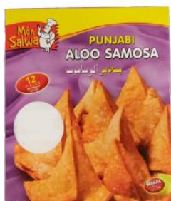
Monsalwa Chatpata Samosa 90 Gm 12 Pcs X 10 Pkt