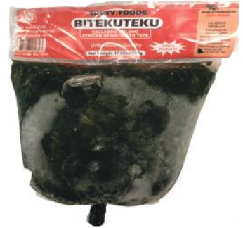
Biteku-tekku / Sweet Amaranth 25 Pack X 500gm